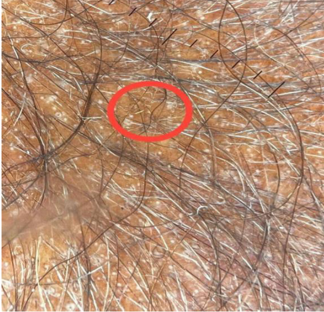
Figure 3. Trichoscopy of woolly hair (1).