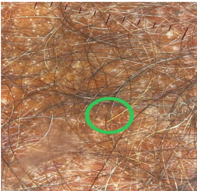
Figure 4. TRICHOSCOPY OF WOOLLY HAIR (2).