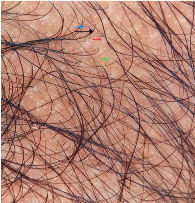
Figure 1. Trichoscopy of loose anagen syndrome.