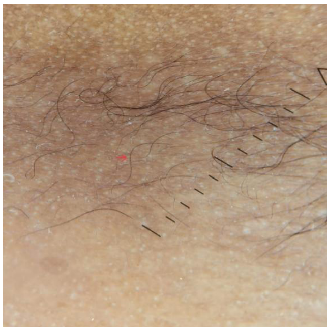
Figure 7. Trichoscopy of congenital hypotrichosis (2).

dysplasia-skin fragility, the woolly hair/hypotrichosis, and the trichohepatoenteric syndrome.