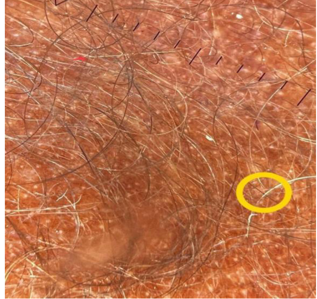
Figure 5. Trichoscopy of woolly hair (3).