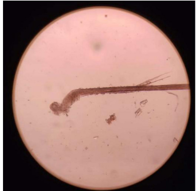
Figure 2. Trichogram of loose anagen syndrome.